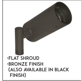
•FLAT SHROUD •BRONZE FINISH (ALSO AVAILABLE IN BLACK FINISH)